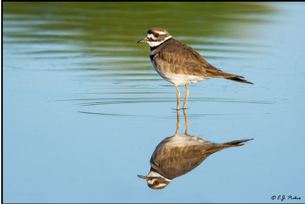
Killdeer - D7100 in 1.3x DX crop mode handheld, 80-200 f/4.5-5.6G @ 400mm