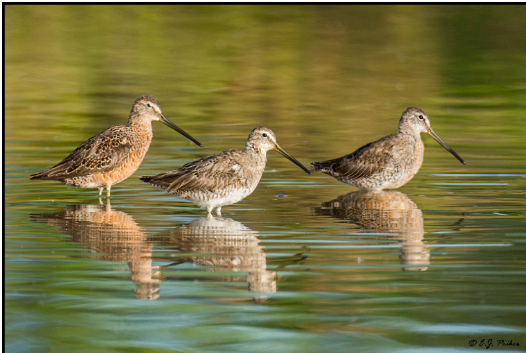
Long-billed Dowitcher - D7100 in 1.3x DX crop mode handheld, 80-200 f/4.5-5.6G @ 400mm

Many will ask, can I use this lens with a Teleconverter for even more reach? I did briefly test this and in the center it is a credible combination. Of course AF speed is compromised and corner sharpness leaves a lot to be desired but in a pinch, the center is plenty sharp for internet or small print uses. In cropped DX frame mode (1.95x) you would have a field of view equivalent to that of a 1092mm on a full frame camera. Stopping down to f/10 makes things even better especially on the larger pixel cameras.