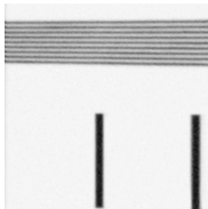
300mm f/4 + 1.4x

A comparison of the new 80-400mm versus the 70-200 with 2x or versus other offerings like the Sigma 120-400, 50-500 and 150-500 also reveals this lens significantly superior to those options. The Sigma lenses are dispatched easily with this lens being sharper in all regimes and all parts of the frame. It really isn't close at all. Some have also asked how it compares to the Canon 100-400. The new Nikon 80-400 is superior to this very old lens in every category except build strength which easily goes to the all metal Canon lens. But optically and especially in auto-focus speed there is no comparison. It also easily outperforms the Nikon 70-200 f/2.8G VR2 with 2x III teleconverter in all regimes. At 280mm, the 70-200 f/2.8G VR2 with the 1.4x II shot at f/5.6 is slightly superior in the center and significantly superior on the edge for sharpness and resolution to the 80-400 at f/5.6. At f/8 the centers are equal but the FX corners are still superior using the 70-200/1.4x combo.